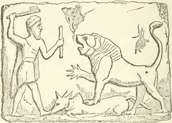
COPY OF CLAY TABLET FROM SINKARA.

ans. Here we see a lion disturbed in his feast on a bullock, by a man armed with a club and hatchet. The lion roaring and lashing his tail, with mane erect, is extremely spirited. This clay tablet, which we take from Mr. Loftus' volume, dates back almost to the days of the Judges, and was found not a thousand miles from Timnath. I do not say this tablet is a picture of Samson,